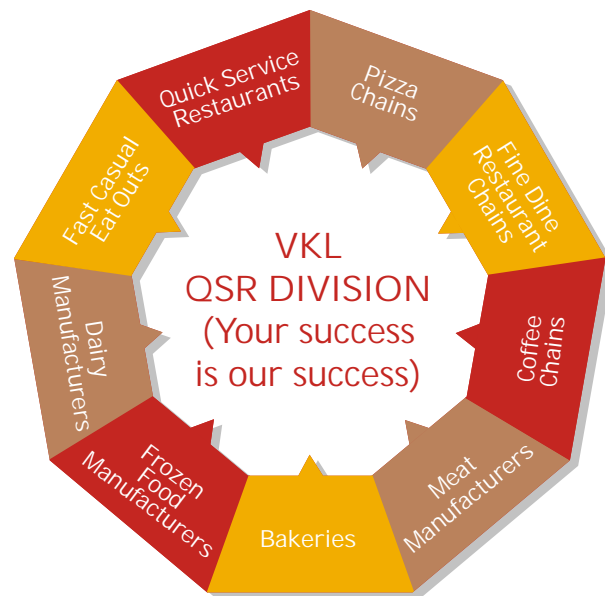
Our Customer Base

We are amongst the pioneers in the Indian Food industry for flavor solutions and have earned our place in the world which led us to service all the major players in the industry. Our presence in India, Middle East and Africa for the prominent industry players has made us the single largest seasoning manufacturer from India.