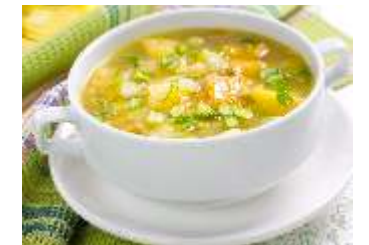
Soups and Gravy Bases:

Create your own sauce with our wonderful seasonings - Dry premixes for water and cream reconstitution - Seasonings for mixing with Mayonnaise or Tomato Base