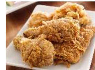
Meat and Vegetable Seasonings:

We provide solutions to flavor your proteins with the best and stable flavor profiles - Marinades, Rubs, Glazes - Seasonings for formed products like Burger, Nuggets, Fingers, etc. - Seasonings for enforced products like Sausages/Salamis etc. - Formed vegetarian products like burgers, Nuggets, etc.